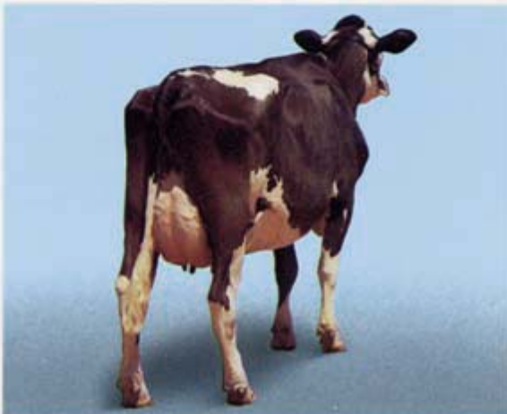
BCS = 2