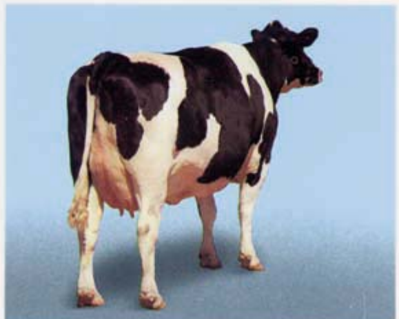
BCS = 5