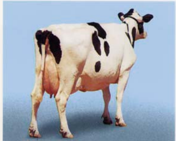
BCS = 3

Body condition scoring of cattle is an essential management tool for the progressive dairy farmer. It can be mastered with a little training and good observation skills, using both sight and touch to evaluate each cow.