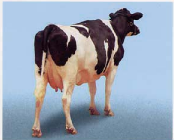
BCS = 4