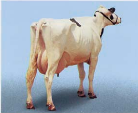
BCS = 1